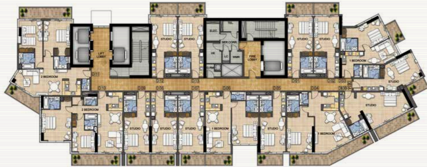
LEVELS 4-6 9-12