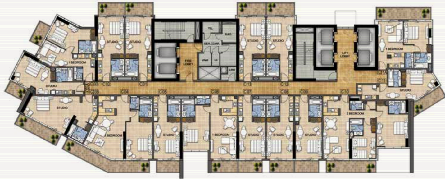
LEVELS 4-7 9-10 12-13 & 15